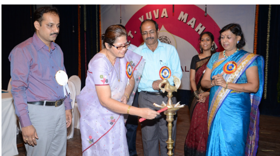
Inauguration Function Overall Championship Trophy