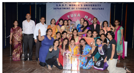
Inauguration Function Overall Championship Trophy