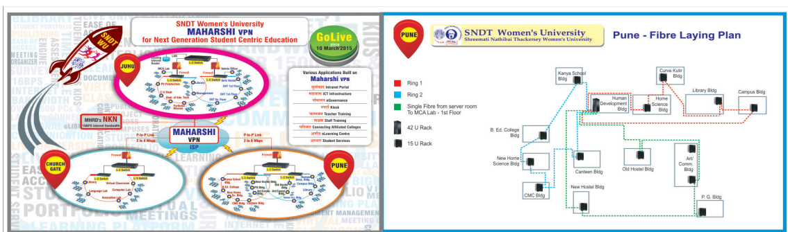
Technology Deployment Plan at Pune