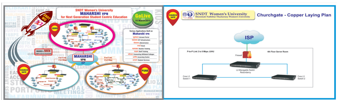
Technology Deployment Plan at Churchgate

The SNDT WU is on an upward journey of investing, deploying and consuming technology to serve better its various stakeholders most of all its students both privileged and underprivileged. The idea is to take technology to the last user to empower.