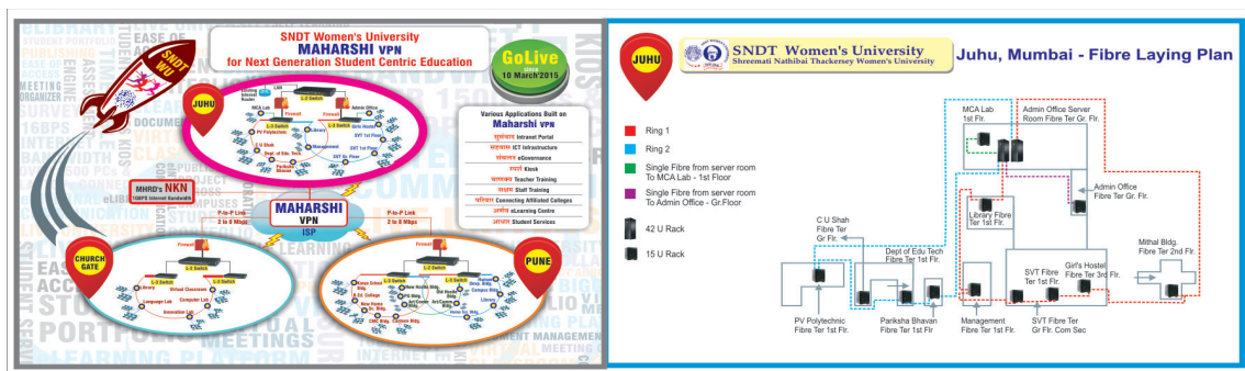
Technology Deployment Plan at Juhu