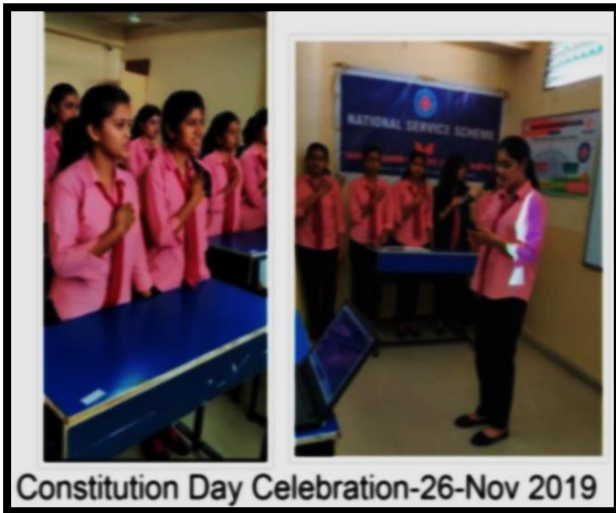
Constitution Day Celebration-26-Nov 2019